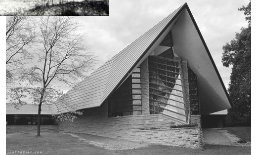
First Unitarian Meeting House, Madison